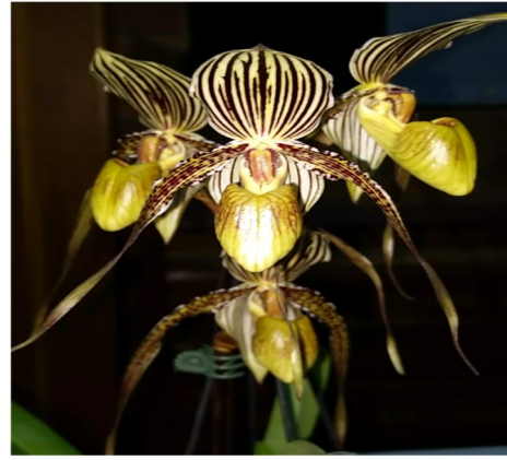
Some of the beautiful benched plants from the June meeting