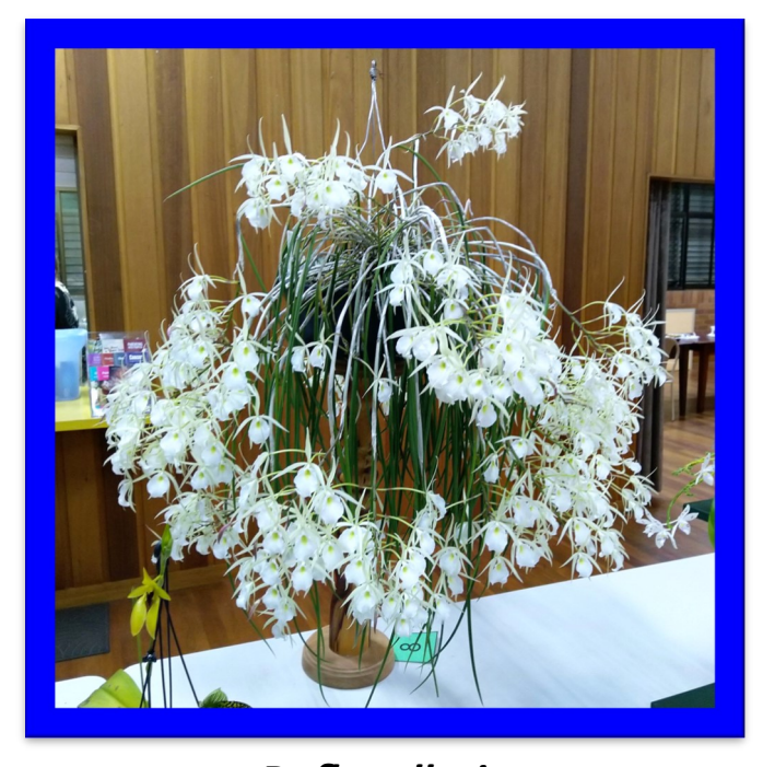
B. flagellaris(C&E Dedekind)