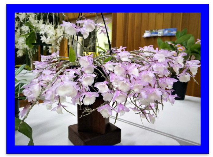
Den. Bohemian Rhapsody