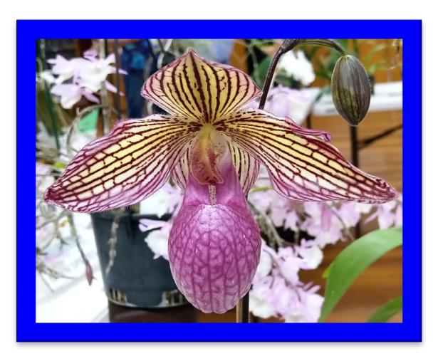
Paph. Gloria Naugle