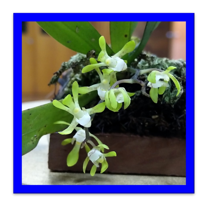
Sarco. Olivaceus