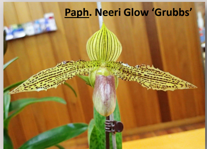
Paph. Neeri Glow 'Grubbs'