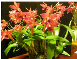
C. Chocolate Drop x Lc. Wrigleyi