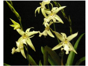
Alcra. Winter Wonderland