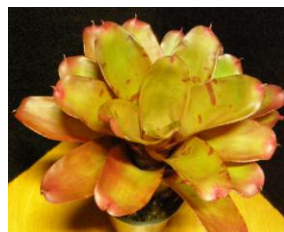
Neo. Copper Blush