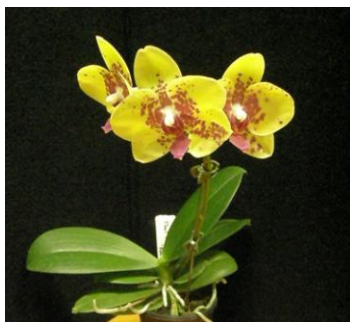
Phal. Meidarland Goldsmith 'Red Apple'