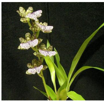
Zygo. Titanic 'June'