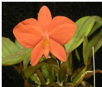
C. coccinea 'Perky'