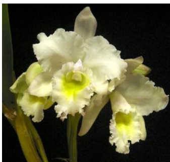
Bc. Mount Hood 'Polar Bear'